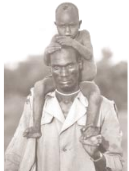
Dinka father and son in Nasir after a 12-day trek to escape fighting.

So the Christian fathers and mothers have to be actively involved in mediating the peace and reconciliation, fostering the spirit of forgiveness. This peace initiative has to come and grow from the grass roots level, which is durable because it is owned by them. They have to identify the causes of the conflicts and devise a mechanism for resolving the national crises. Because through God, all hearts would be transformed.