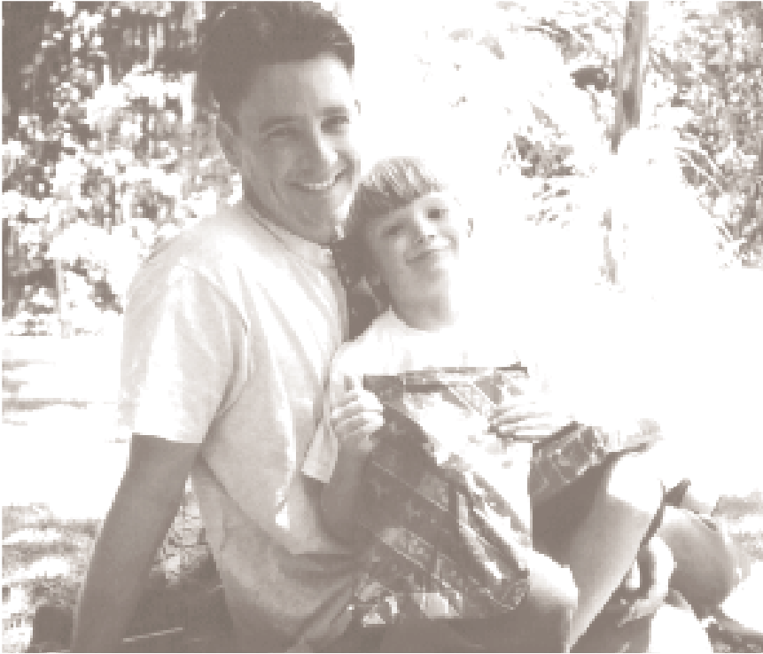
Father and son.