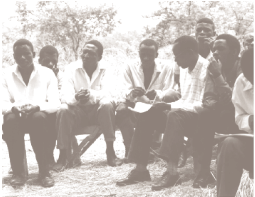
Male members of a Care and Prevention Team, Zambia.

Care and Prevention Teams is a strategy to accelerate community realisation of the resources available within the community to support the weak and sick. In the area surrounding Chikankata Hospital, many widows are heading homes due to HIV/AIDS. This is not to suggest that more men than women are dying of AIDS, but when a man dies he often leaves a number of wives behind due to the prevailing polygamous culture. In a village close to the hospital, the concept of the Care and Prevention Team was introduced by the Chikankata counsellors. The community accepted the strategy and agreed to try it. As in most African communities, the headman and other men in the villages have authority whilst the women do most of the work. What is unusual about this village is that the men are working side by side with the women in caring for people with AIDS. The men recognise that the survival of their community depends on their involvement and in devising ways of caring