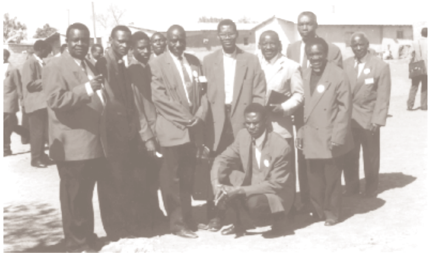
Members of the Fathers' Union, Zambia.

Individual fathers must take the first step in order to strengthen their position. In the Church in Zambia we have now the Fathers' Union and one of their objectives is to work for the family. We can start with