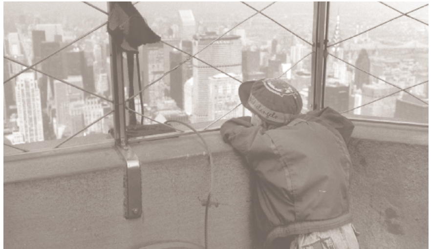
Young man in America.

The USA is now closer to a situation in which family support services are available for mothers, children and fathers. A Bill, passed by the House of Representatives, will