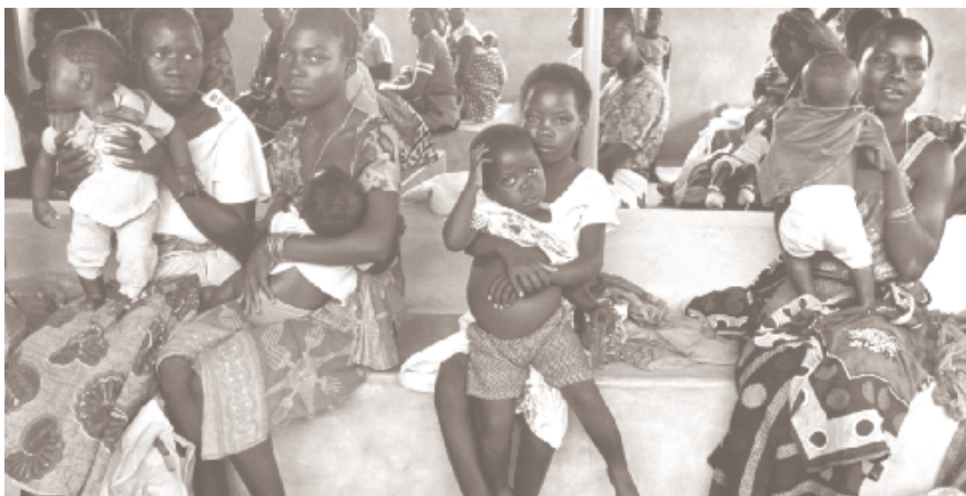
Mother and baby clinic, Tanzania.