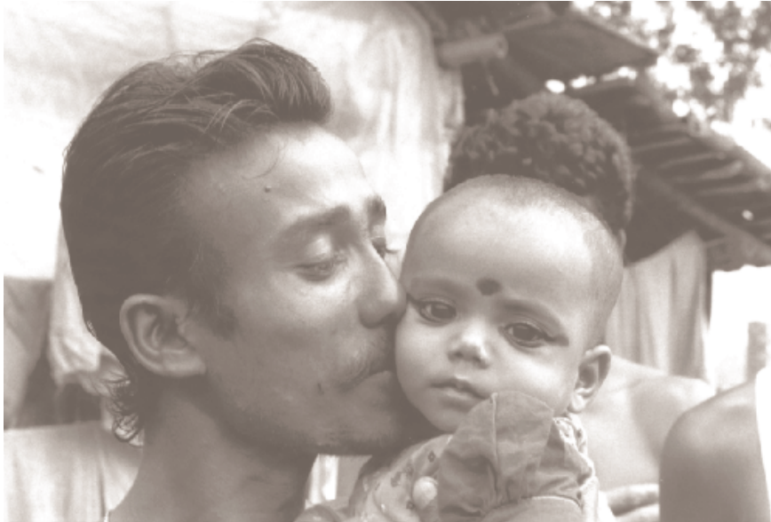
Father and son, slum dwellers of Calcutta.