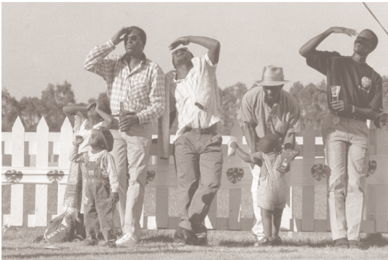
Men with their children watching an aerobatic show, Nairobi, Kenya.