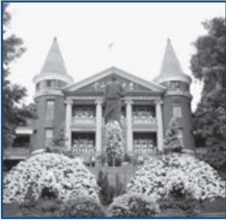
Sun Yat-sen University

The Trustees reviewed the 2005 Triennial in Great Britain, and the evaluations given of it. The general consensus was that it was an excellent conference, with the only drawback being its high cost, and some logistical problems due to there being two sites.