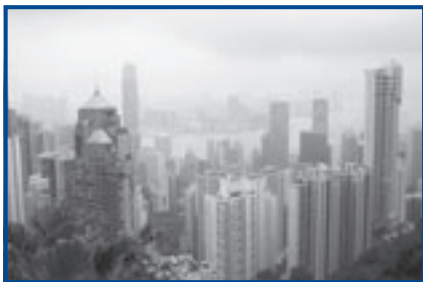
Hong Kong skyline

As the meeting progressed, Trustees were able to take a short subway trip to Kowloon, and then take a ferry across the harbor to central Hong Kong. Amidst the many modern skyscrapers still stand some of the buildings from the colonial administration.