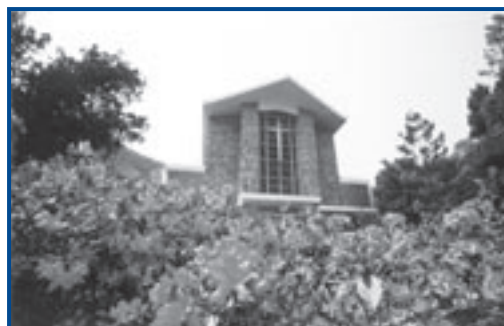
Chung Chi College