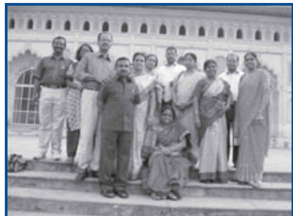
CUAC India Chapter Meeting 2008