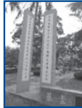
Entrance Gate to the Chinese University of Hong Kong, 1965 Sublime is love for all that finds no bound.

Following the change in leadership in China in the late 20 th century, Western cultural influences surfaced again. However, the Chinese reception and response this time was quite different. While incorporating much of the technology of Western science and engineering, the culture did not immediately become entrepreneurial. Such is illustrated by many of the colleges and universities which were founded in the early 20 th century that are now functioning in the 21 st century. They certainly intend to equip their students with necessary mathematics, science, and