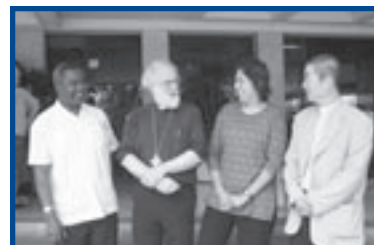
The Most Rev. Rowan Williams with TEAC Regional Associates from Africa, Mexico and Korea