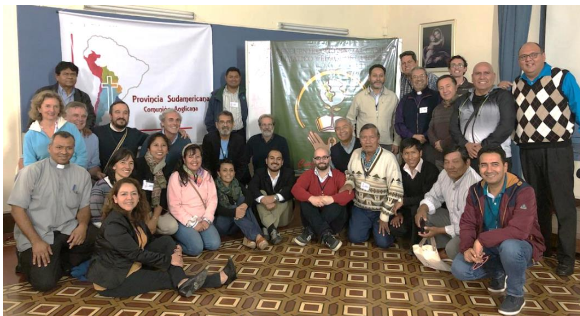
Participants in the first Provincial gathering on “Climate Change and the Church”. (For full list of participant names see Annex 1)