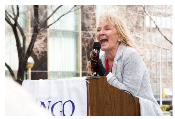
Beth in action.

And many, many more. Messages of condolence, love and prayer are still being received.