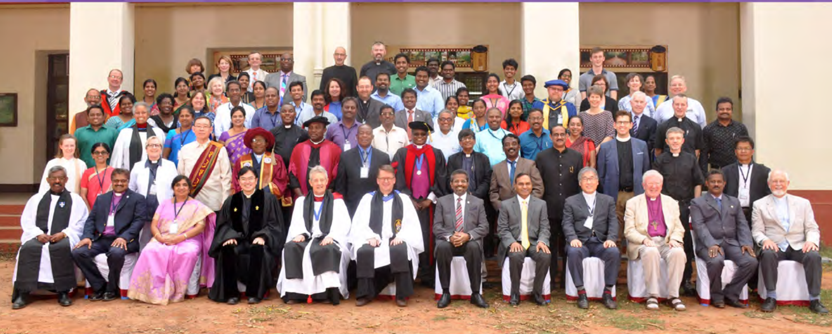
January 04 - 10, 2017 Madras Christian College (Autonomous) East Tambaram, Chennai, India