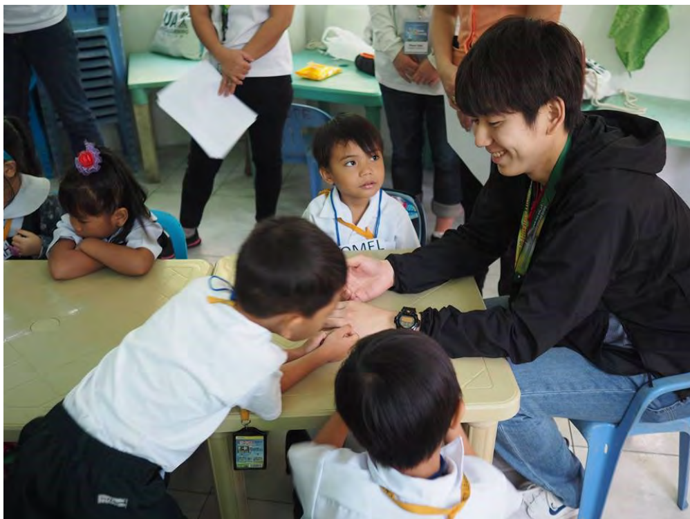
A Japanese student with Filipino schoolchildren at CUAC's 2017 Service Learning Program, held at Trinity University of Asia