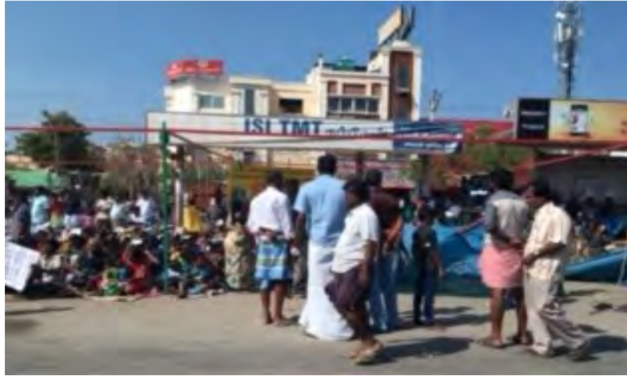
Demonstrators blocking a Madurai street, January 20, 2017

I needed it badly on January 20. I had spent an extraordinarily rewarding week wandering around South India after the Triennial had ended, and I was headed to the Madurai airport for my late night Spice Jet flight back to Chennai and homeward to New York. But there were about one hundred college students sitting in the road between me, my luggage, and the gate. A horde of policemen hovered about. The sky grew darker, a little rain began to fall, and I wondered if I would be spending the night in a wet field.