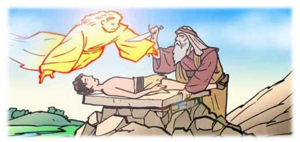
And Abraham laid Isaac on the altar. But then an angel stopped Abraham. "Do not sacrifice your son," said God. "You have shown your devotion to Me by not withholding your only son from Me."