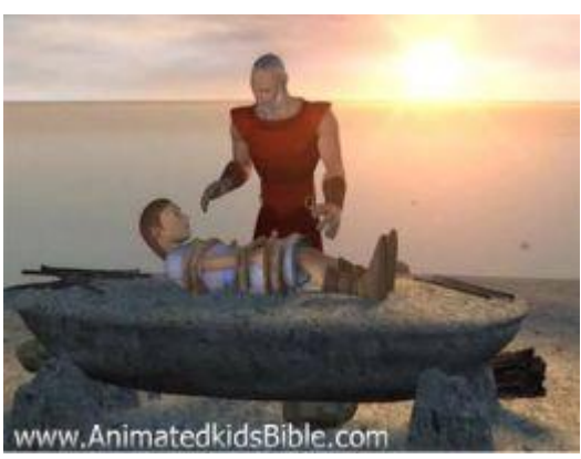
Here a picture of Abraham about to Sacrifice his son Isaac for God but it's only a test