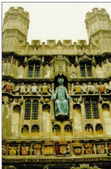
Christ Church gate welcomes visitors to Canterbury Cathedral

Coaches will leave the university at 8.30am sharp.