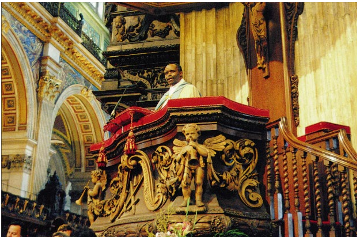
Mozambique's Bishop Dinis Sengulane of Lebombo preaches on July 12 in St Paul's Cathedral, London.