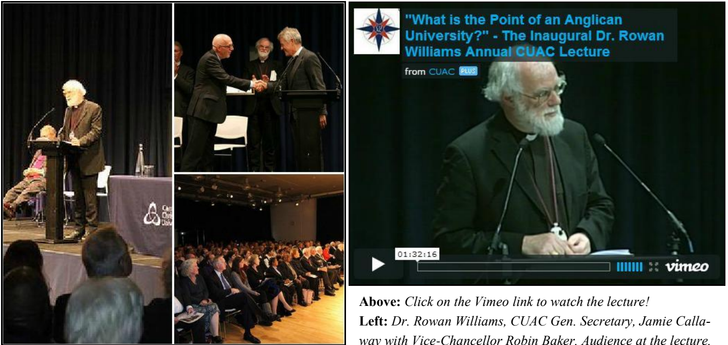
Above: Click on the Vimeo link to watch the lecture!