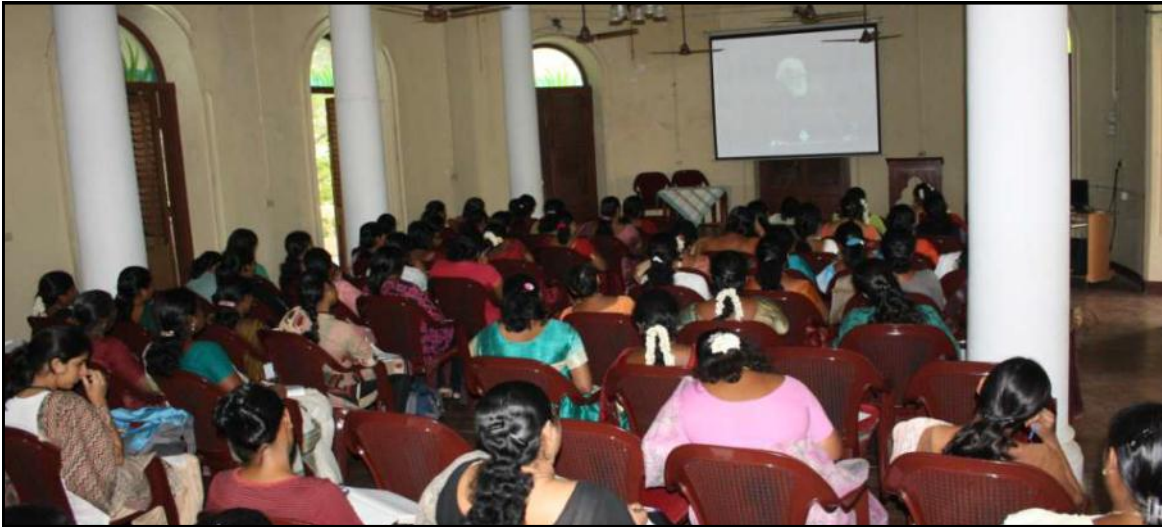
Women gather at Women’s Christian College in Chennai, India to watch Archbishop Rowan Williams.