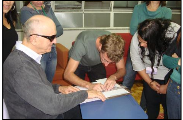
FAE students being introduced to a Braille text for the blind

With new ventures in post-graduate studies and a growing repository of historical archives and records, Codrington College is prepared to continue fulfilling its mission to be a center of excellence in the delivery of theological education into the future.