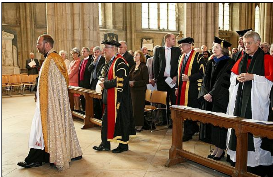
Jubilee Service of Thanksgiving

This year Canterbury Christ Church University is celebrating a landmark anniversary as it turns 50.