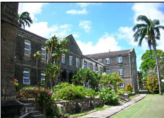
Codrington College, Barbados