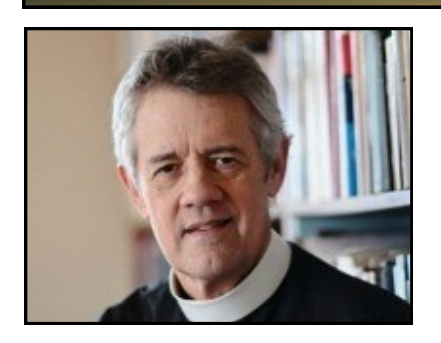
The Rev. Canon James G. Callaway, D.D. General Secretary

When I have the pleasure of visiting Anglican schools I am struck by the ways they are alike yet are very different from the others I have seen. When I was in first grade I remember sitting at a little table in the shop room with a woman who showed me pairs of pictures with the question "are they alike or different?" One showed a tree with the sun overhead and I noticed that in one there was a shadow under the tree that was missing in the other.