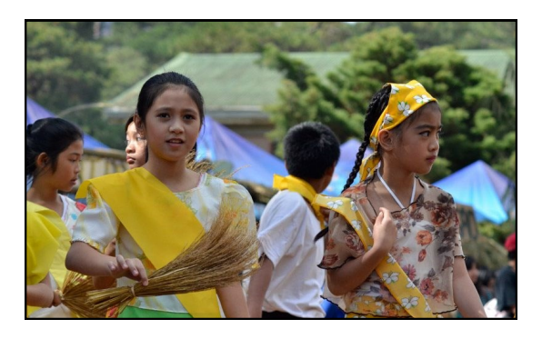
Images from the 107th Charter Day Anniversary celebrations at Easter College, Baguio City, the Philippines