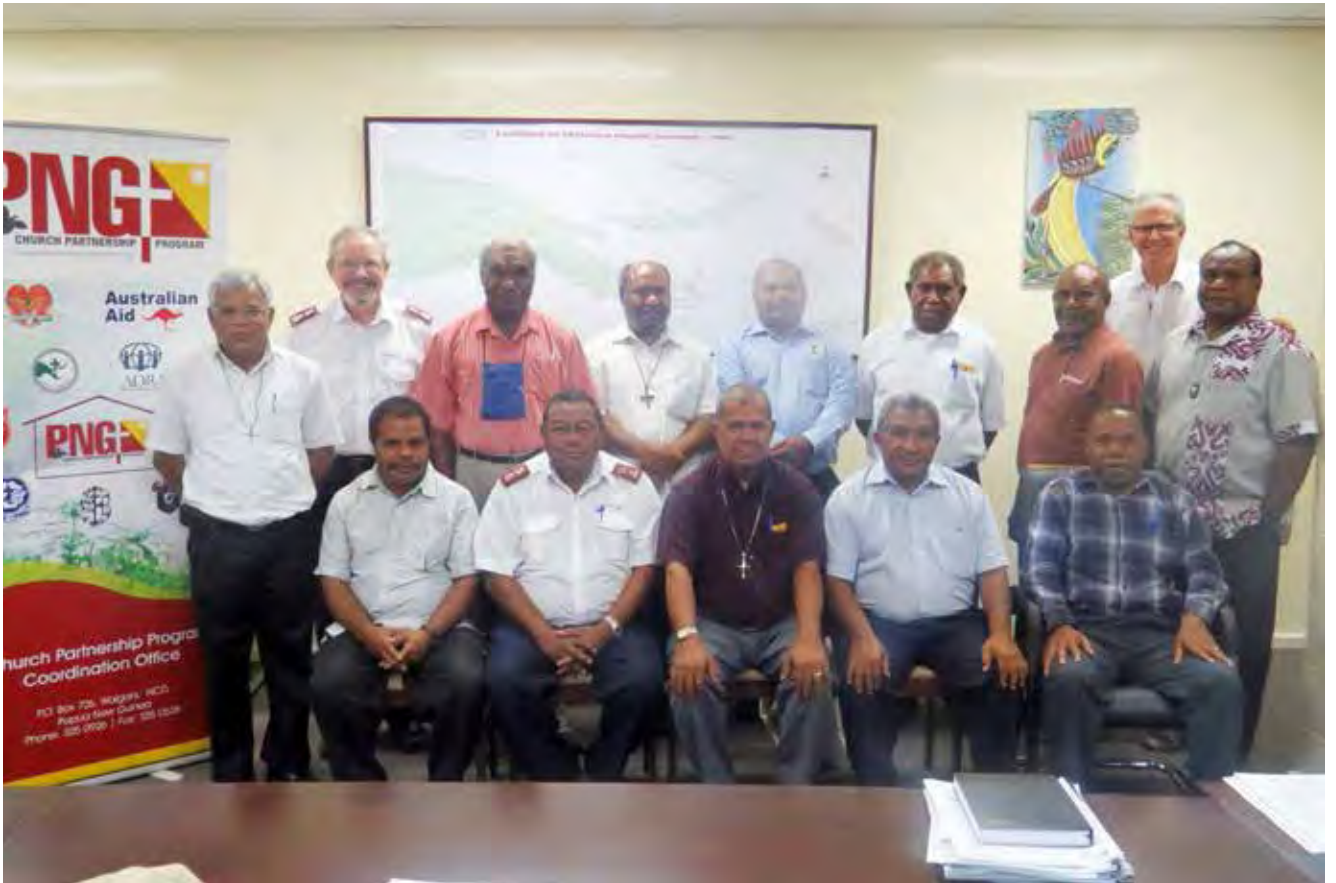
Church Leaders Council pose for a photo after considering the Theology of Gender Equality.