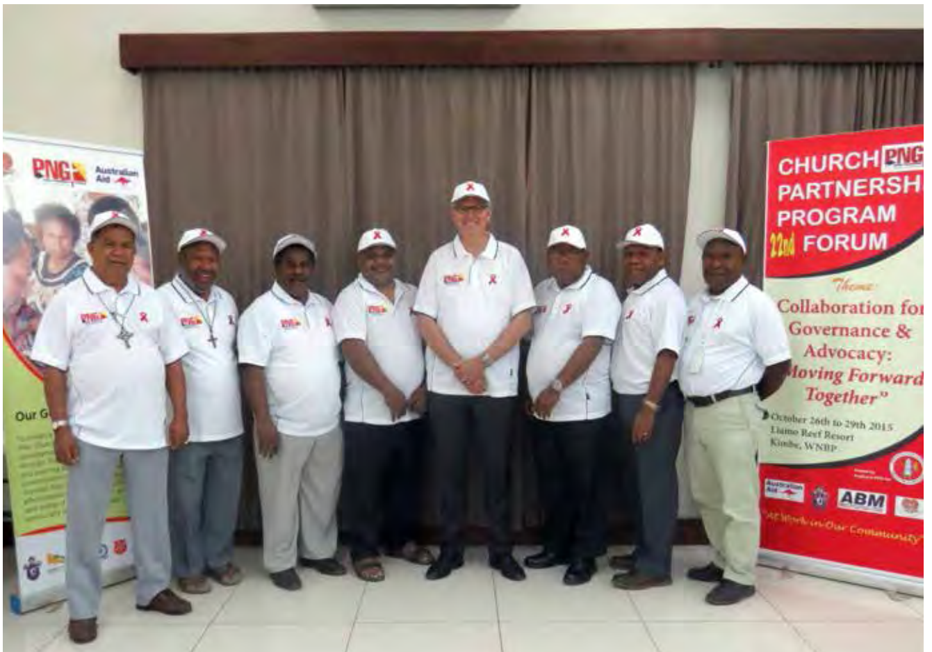
Church Leaders Council advocating for rights of people living with HIV/AIDS in 2015.