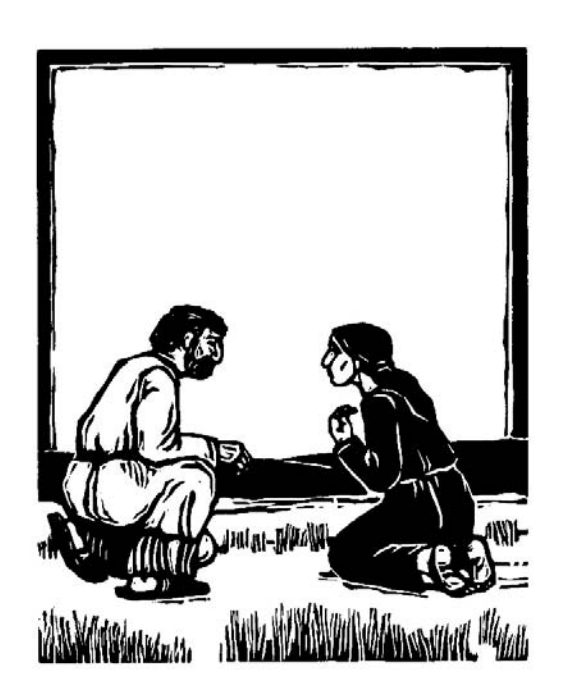
9. You have comforted me [2:13]