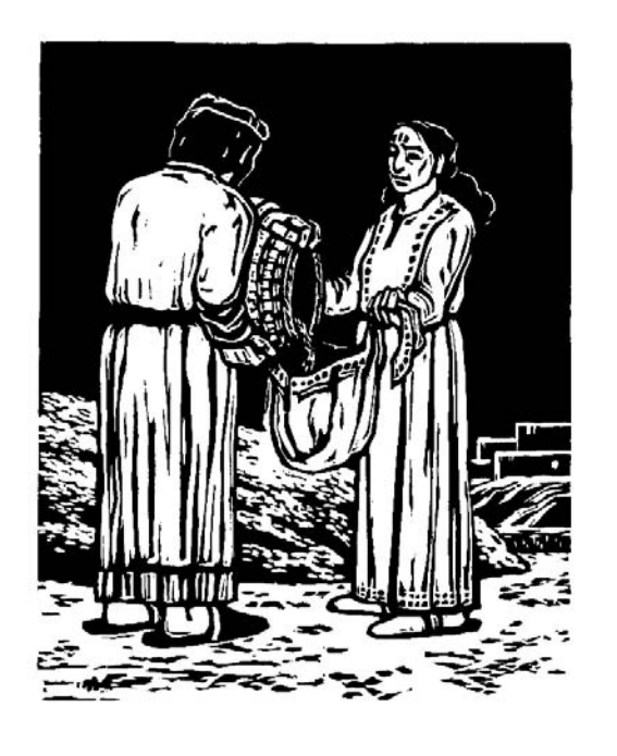
14. He measured six barleys [3:15]