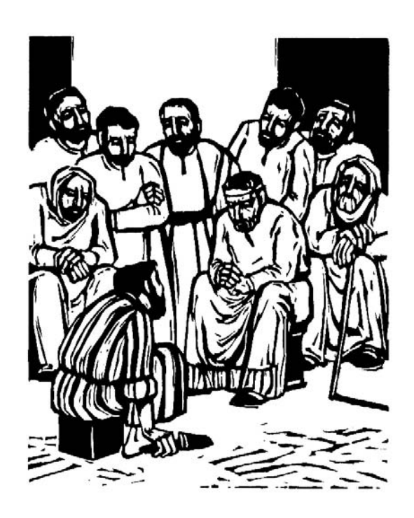
16. He removed his sandal [4:8]