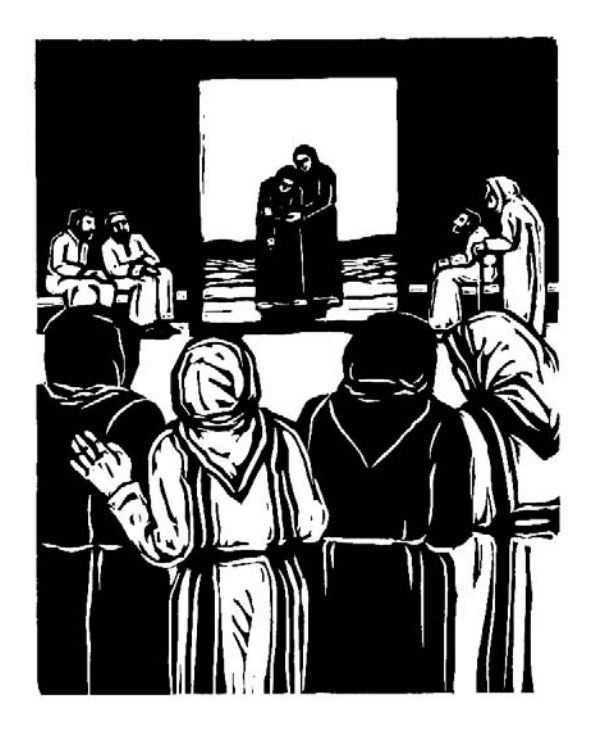
5. Is this Naomi? [1:19]

3. They lifted up their voice and wept [1:14] 4. Don't press me to leave you [1:16]