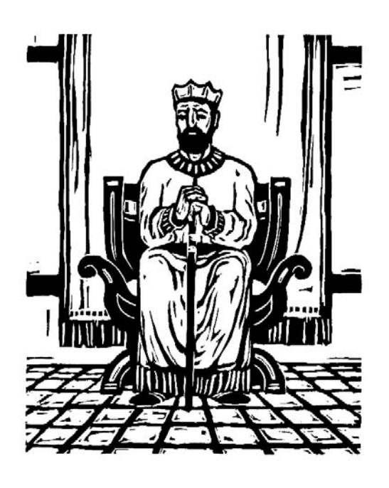
20. Jesse sired David [4:22]