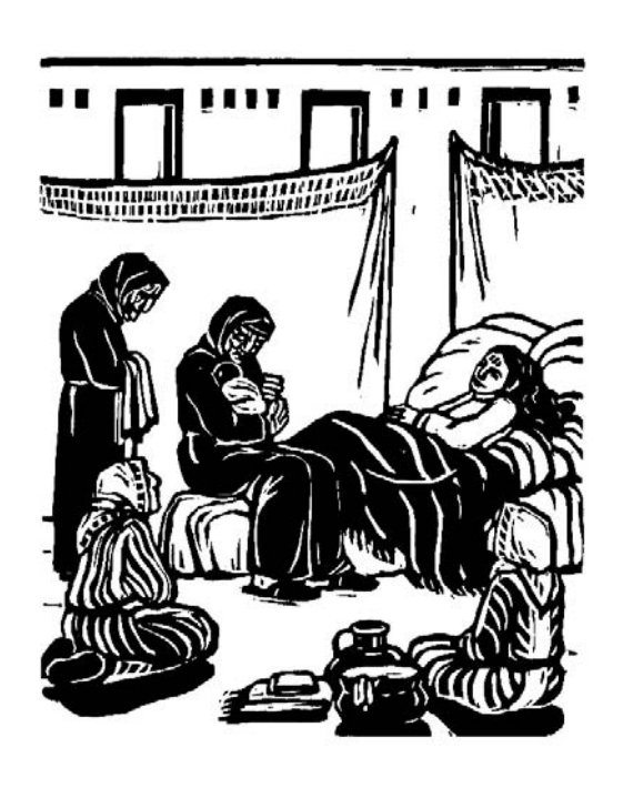
19. Naomi took the child [4:16]