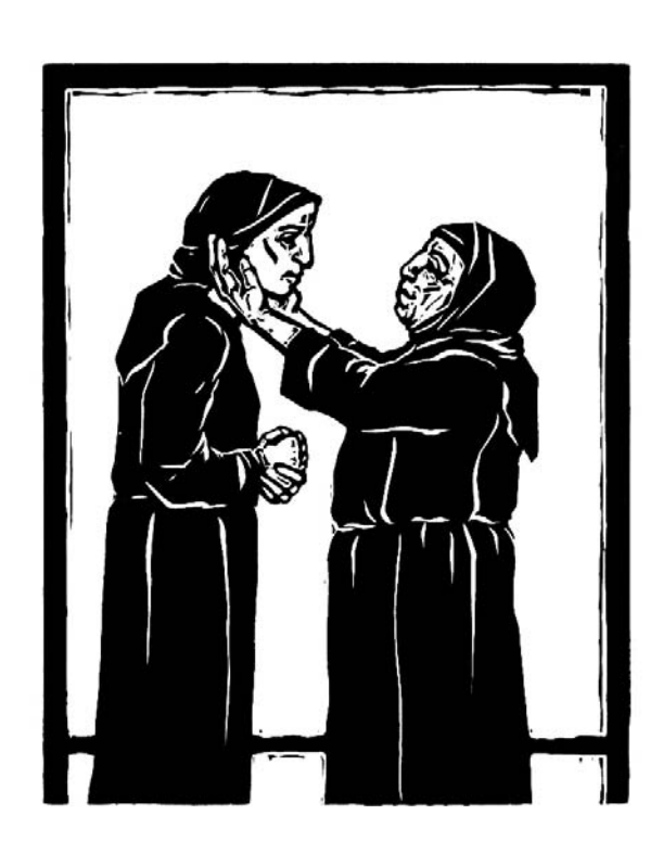
12. Wash up and anoint yourself [3:3]