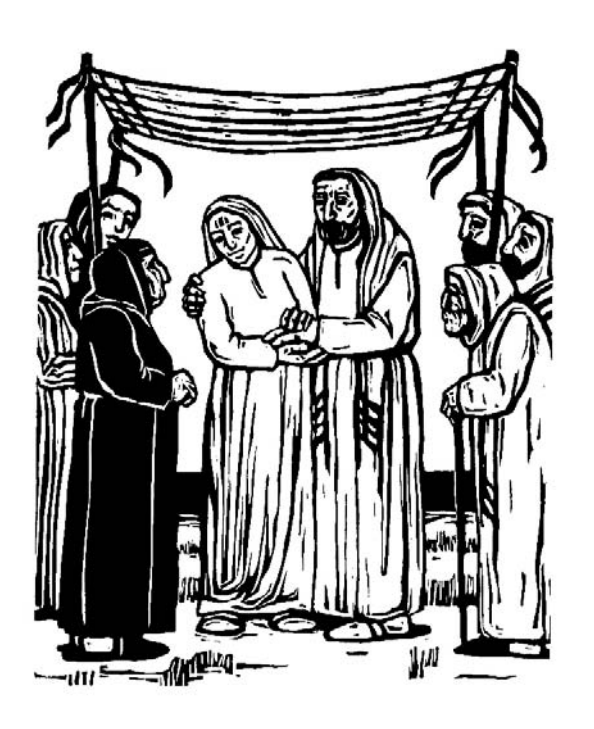
18. She became his wife [4:13]