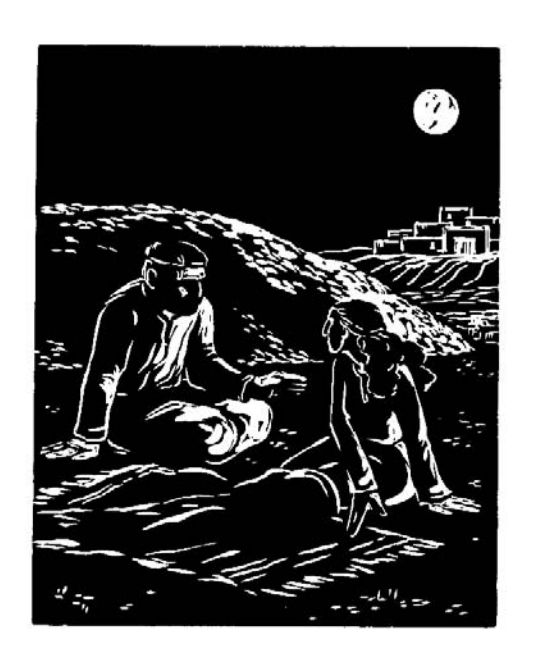
13. Who are you? [3:9]