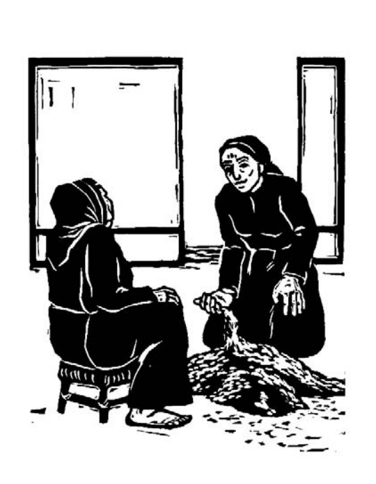
11. Her mother-in-law saw [2:18]