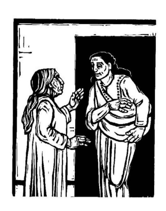
15. Who are you my daughter? [3:16]