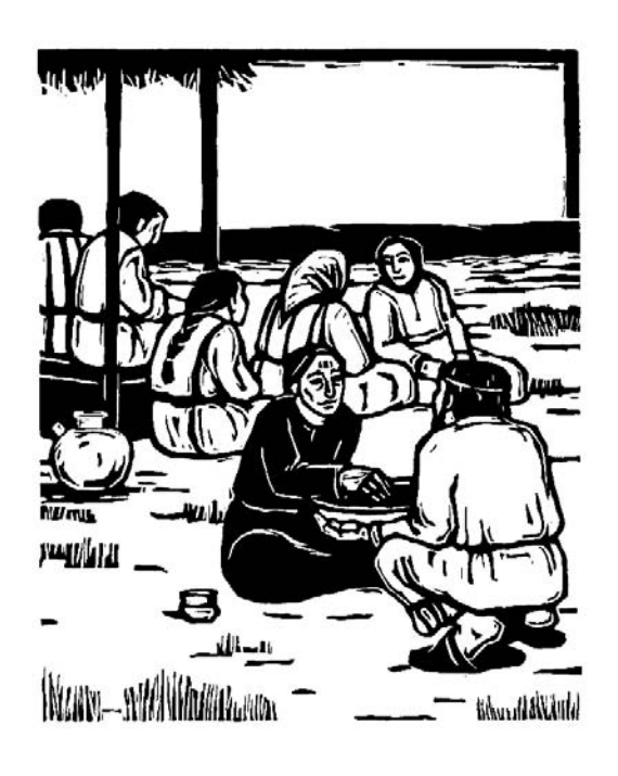
10. Come here and eat [2:14]