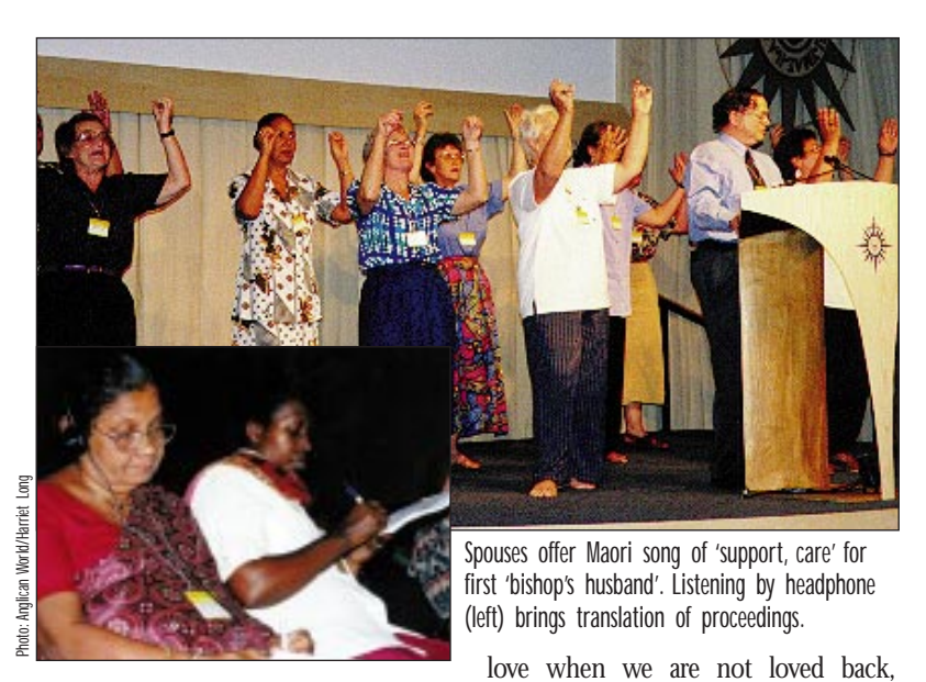
Spouses Continued from page 1

part of their partners' ministries. Though most had their own professions—nurse, academic, occupational therapist—they all described commitments to personal ministries. And finally, several offered advice: find a "soul friend," involve yourselves "outside the Church," rely on God.