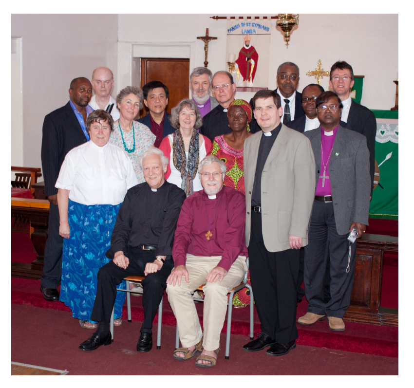
Members of AMICUM in St Augustine's Church, Langa, South Africa