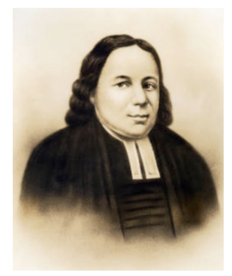
Thomas Coke 1747–1814