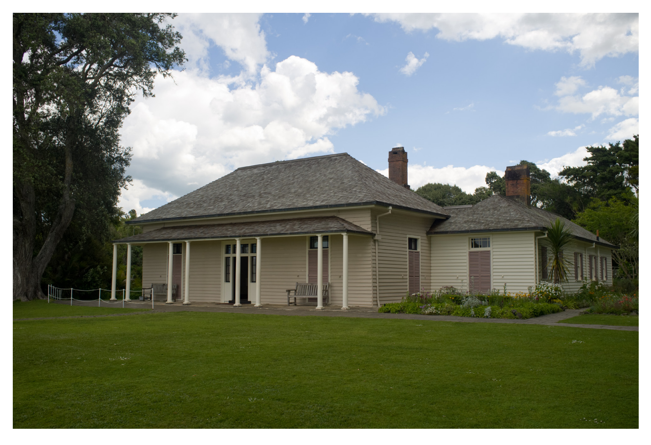
Waitangi Treaty House, North Island, Aotearoa-New Zealand